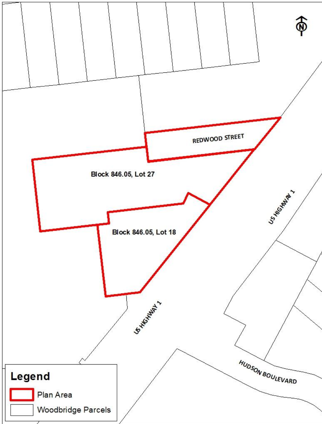
Figure 1: Redevelopment Area Parcel Map