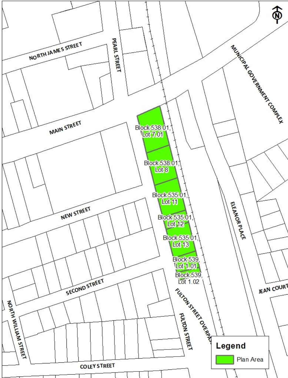
Figure 1: Downtown Woodbridge, Area 8 Parcel Map